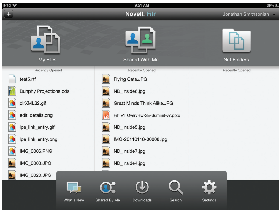
Figure 2. Filr provides users with a consistent file access experience whether they access their files on the iPad as shown here, on their smartphone, or on their laptop.

Filr works in Micro Focus Open Enterprise Server or Windows Server environments and integrates with NetIQ eDirectory and Microsoft Active Directory.